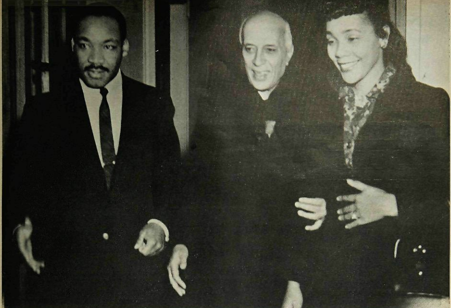
Prime Minister Jawaharlal Nehru welcomes the Rev. King and wife, Coretta. "We were looked upon as brothers," King says, "with the color of our skins as something of an asset. But strongest bond of fraternity was the common cause of minority and colonial peoples in America, Africa and Asia struggling to throw off racialism, imperialism."