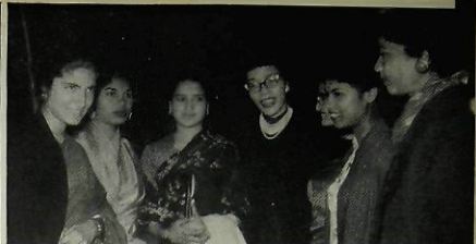
University students chat with Mrs. King in New Delhi. She was interested in status of women. King says spirit of Gandhi is still alive in country. "By all standards," he says, "the (Gandhi) is one of the half dozen greatest men in world history."

ADULTS Try regular Black-Draught in Powder or Granulated form. Or get new easy-to-take Tablets! At all druggists!